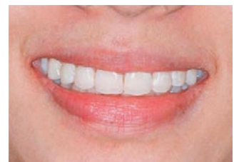
Before and after treatment with Invisalign – invisible aligners that straighten teeth.